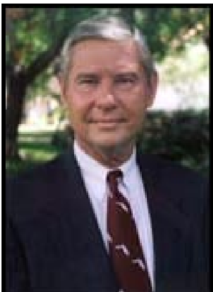
Sen. Bob Graham

Graham is currently running for reelection in the U. S. Senate. His campaign consists of his workdays, which is when he travels around the state working in different jobs, such as construction and janitorial jobs.