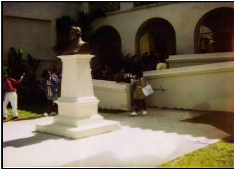
The west entrance of Miami High was where the incident took place.

For any student(s) having problems that could result in a violent confrontation, speak to any of the counselors or teachers who will help set up a peer mediation. Remember that violence is never the answer.